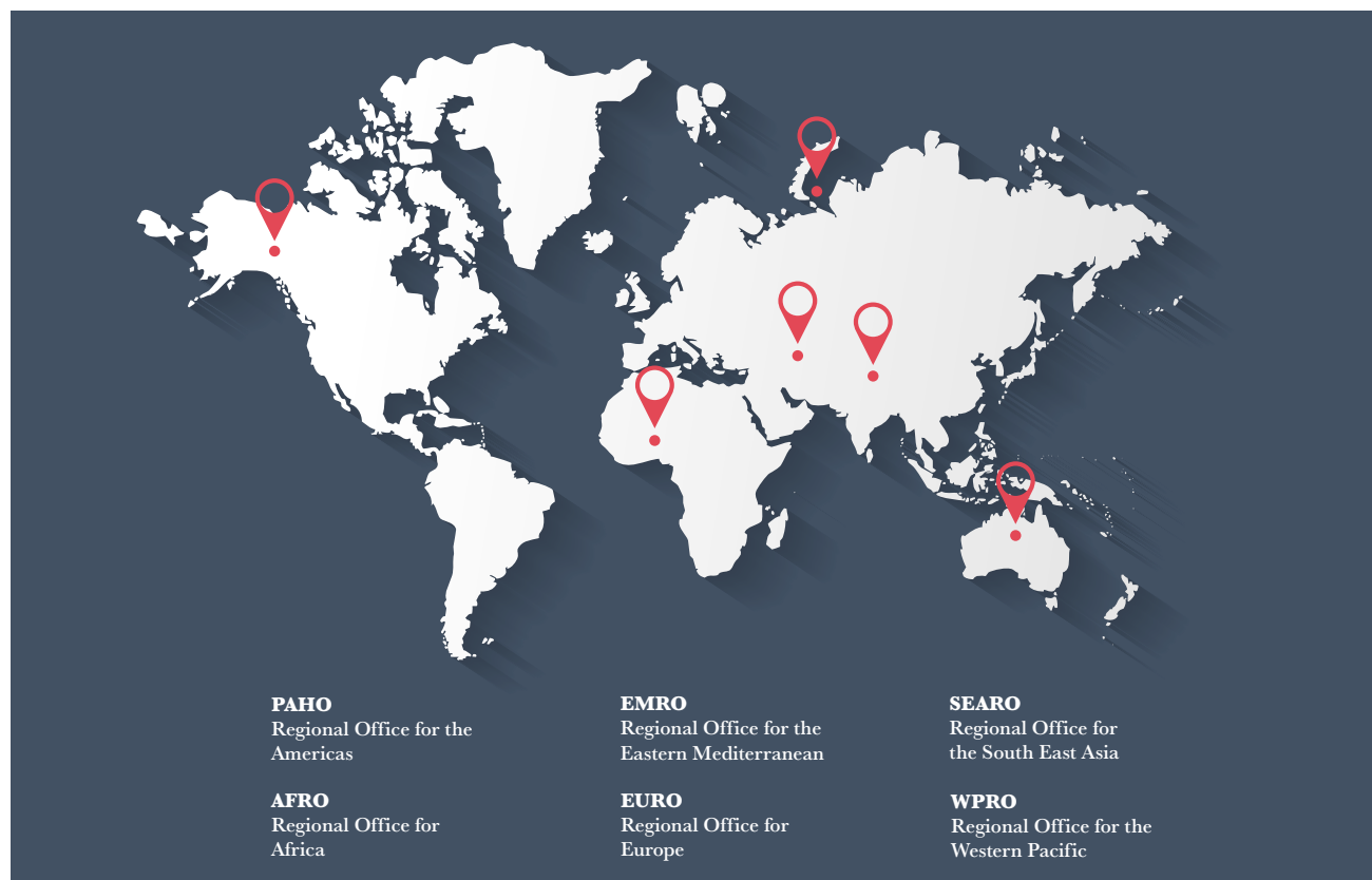
Figure 1: Selected Countries from 6 WHO regions

The United Nations World Population Prospects 2022 reports that Europe and North America had the highest proportion of older adults in 2022, and that by 2050 every one in four persons could be over the age of 65. In contrast, Sub-Saharan Africa is projected to have a smaller growth of the ageing population. 13