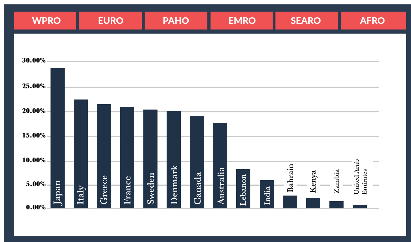
Figure 2: Proportion of Ageing Population Across WHO Regions

During 2021 in the WPRO region, Japan had the largest ageing population (over the age of 65 years) at 28.40%, followed by Italy (23.4% in the EURO region). 32,33