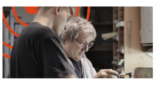
Voice and engagement Leadership and capacity building https://www.who.int/initiatives/decade-of-healthy-ageing